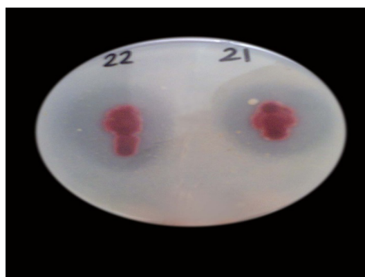
Figure 1. Zone of chitinolysis